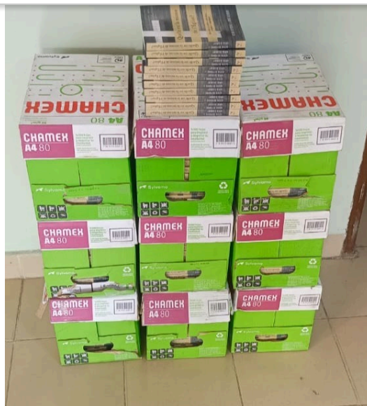
The 300 books printed and ready for the conference