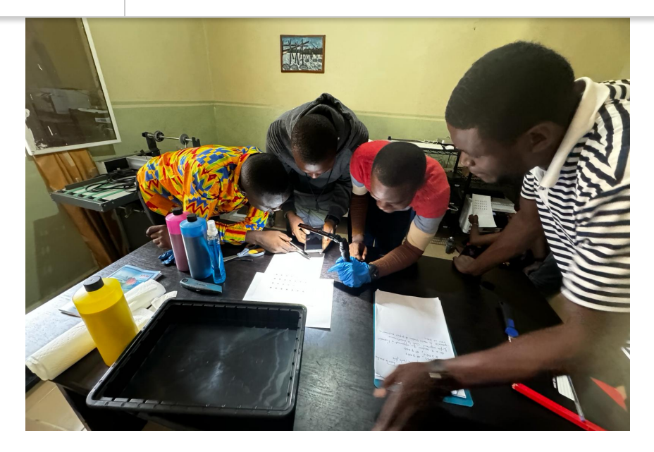
Training at the print-on-demand center in Kinshasa