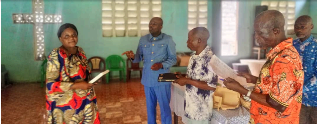
Recipients of new Bibles