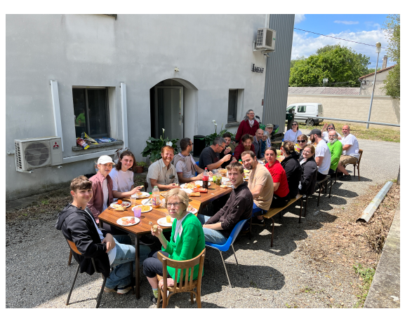
Members of the 2024 IQ team having fun at Camp des Îles in Quebec (left) and the 2024 FIT enjoying a communal feast at Iméaf in France (right)