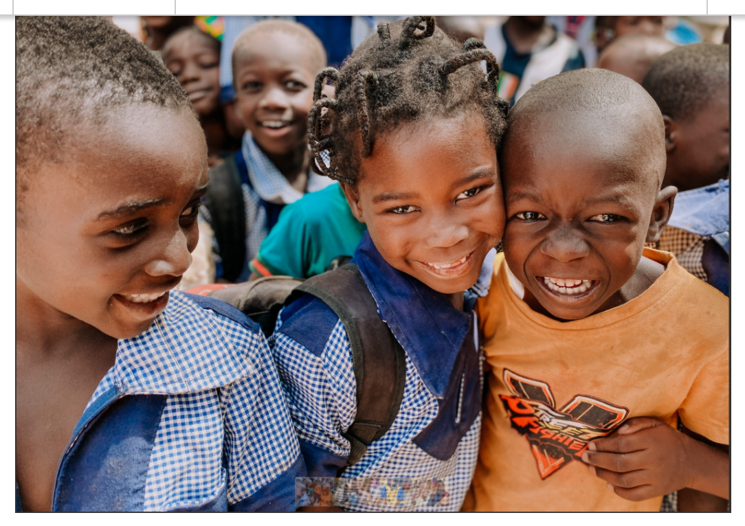
Children served by GO in Senegal