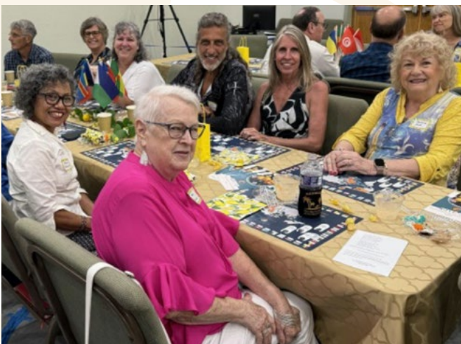
Participants at the celebration in Minneola.

As together we continue to serve the French-speaking world that God loves, we look to Him for "Strength for today and bright hope for tomorrow – Blessings all [ours], with ten thousand beside!"