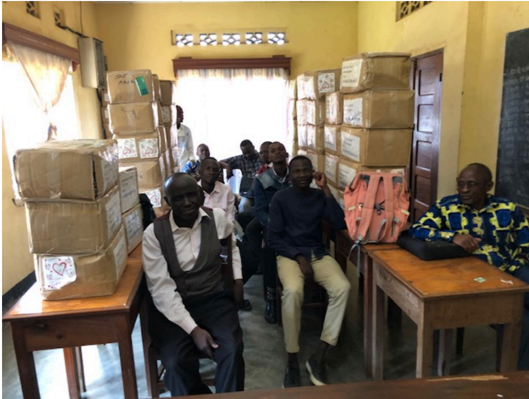
A special meeting dedicating the 12 chaplains trained last summer and giving them their libraries