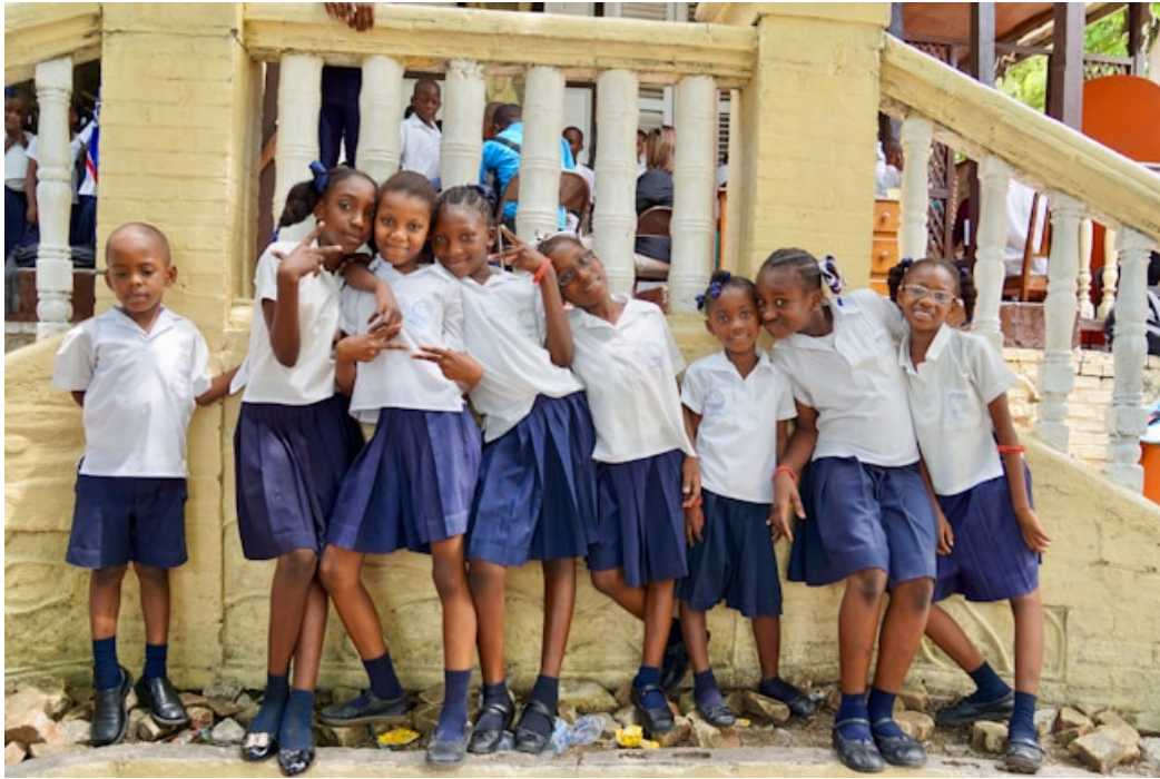
Haitian school children in Port-au-Prince in 2021