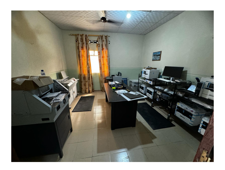
POD printing equipment