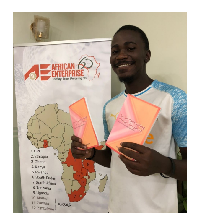
POD training (left) and trainee holding his first printed book (right)