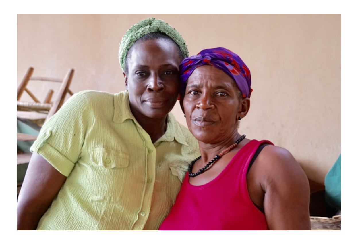
Two Haitian women at a market in Port-au-Prince in 2020