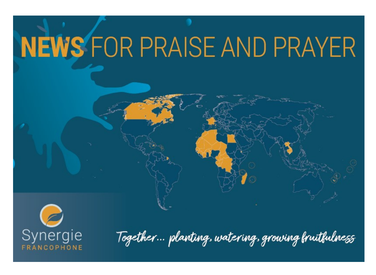
July 20, 2022

As the rain and the snow come down from heaven, and do not return to it without watering the earth and making it bud and flourish, so that it yields seed for the sower and bread for the eater, so is My word that goes out from My mouth: It will not return to Me empty, but will accomplish what I desire and achieve the purpose for which I sent it. Isaiah 55:10, 11 (NIV)